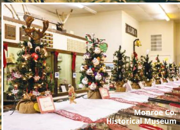
Monroe Co. Historical Museum